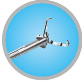
Forceps with rat teeth