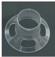
P03 Anorectal dilator