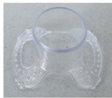
P04 Purse-string suture anoscope