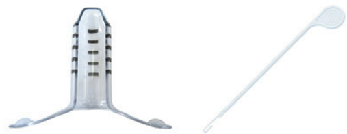
P05 Suture threader