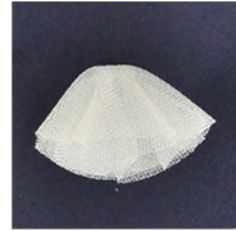
C: Plug Type