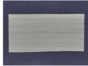
A: Flat Sheet Type

Wall Reinforcement Knitted Polypropylene Hernias, Incisions, Prolapses, Laparoscopy, Laparotomy